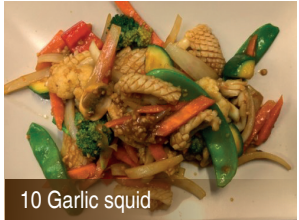
10 Garlic squid