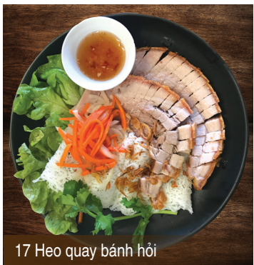
17 Heo quay bánh hỏi