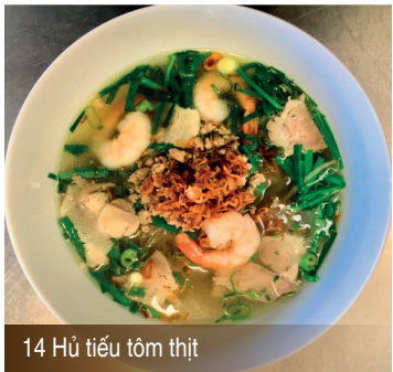
14 Hủ tiếu tôm thịt