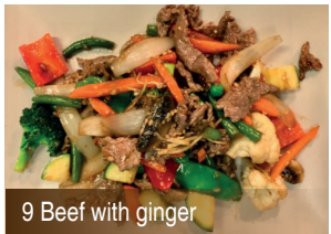
9 Beef with ginger