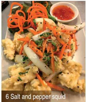
6 Salt and pepper squid