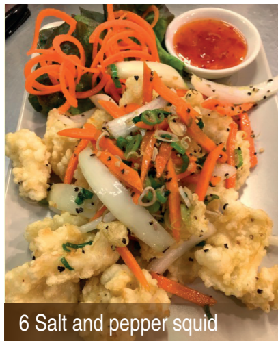
6 Salt and pepper squid