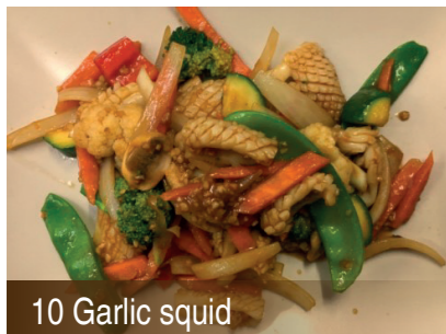
10 Garlic squid