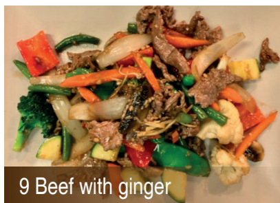
9 Beef with ginger