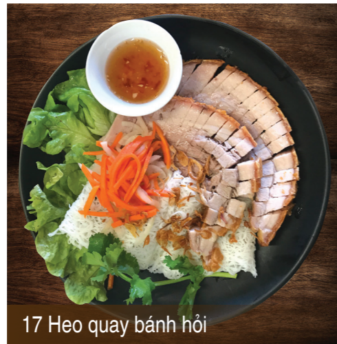
17 Heo quay bánh hỏi