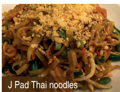
J Pad Thai noodles