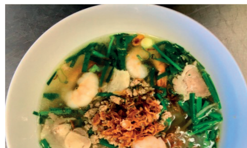
14 Hủ tiếu tôm thịt