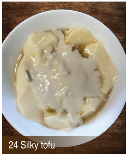
24 Silky tofu